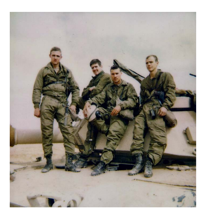
Figure 3: The author in Desert Storm.

From recalling these conflicts, we realize that America has been at war for essentially your whole sentient lives. Since you were five or six years old on September 11th, America has been at war. My belief is that the U.S. experience has marked you in some ways not unlike J. Glenn Gray's experience marked him. I'm going to show something that can be a little tough.