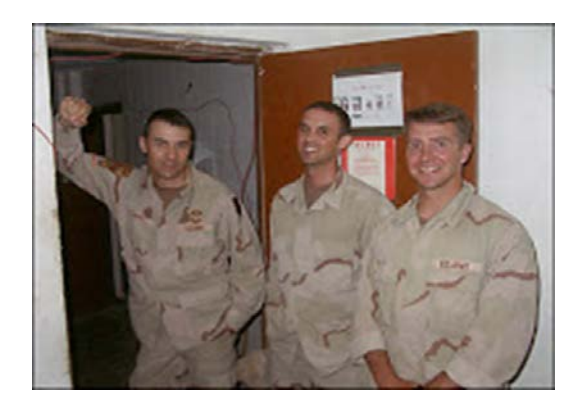
Figure 4: The author with friends during Desert Storm.

Friends all. In some ways, friendships are never stronger than when they are under such risk, and life is never sweeter than when you realize it may be ending very quickly.