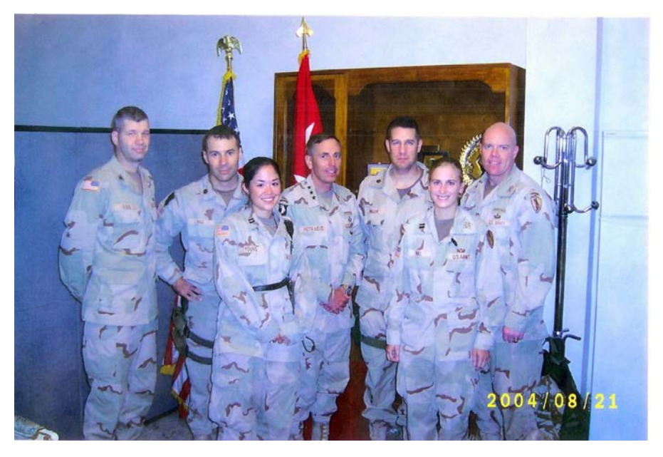
Figure 5: The author with General David Petraeus.