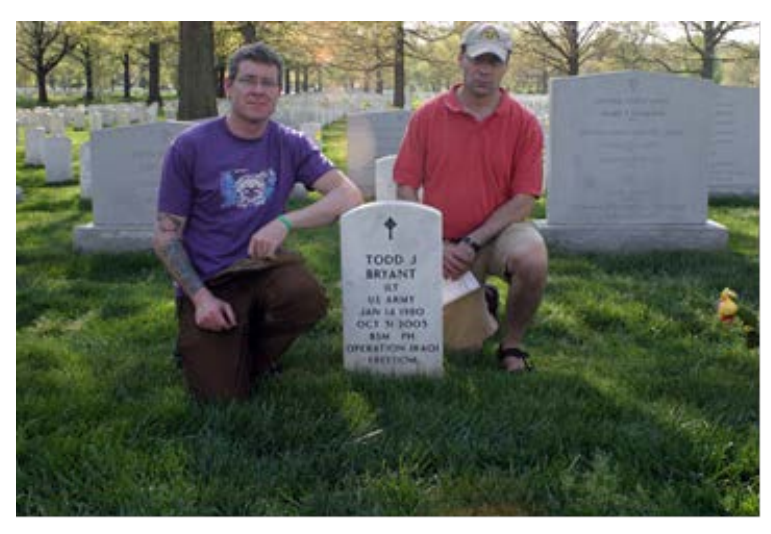
Figure 7: The author in Arlington National Cemetery.

Death obviously is an important part of war. I'm conscious of the legacy of death and the history of the lands in which we fight. I'm standing in Iraq (Figure 6), a country in which I fought two wars myself, and I'm standing next to the tombstone of a British soldier who died in Iraq in the 1930s, because Iraq was a British possession. It can't be lost on us that it is a country that has been fought over for the last 100 years.