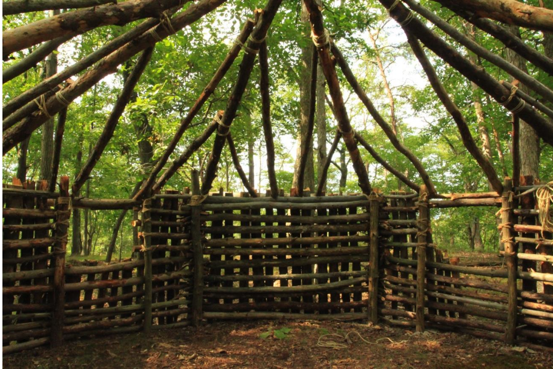
Figure 2: This is the completed foundation, using dead logs from the area.

As I hinted earlier I became upset that I did not have as much leisure time as I had expected. I held the romantic idea of being in a hut in the woods, having a lot of time for the joys of an introverted life: to read, write, and contemplate. For example, Thoreau bathed in his pond every morning and talked about the religious implications of that according to Grecian philosophy, but I did not have the time to do those things because I was a student and I had a part-time job. In Thoreau's idyllic account he recorded: