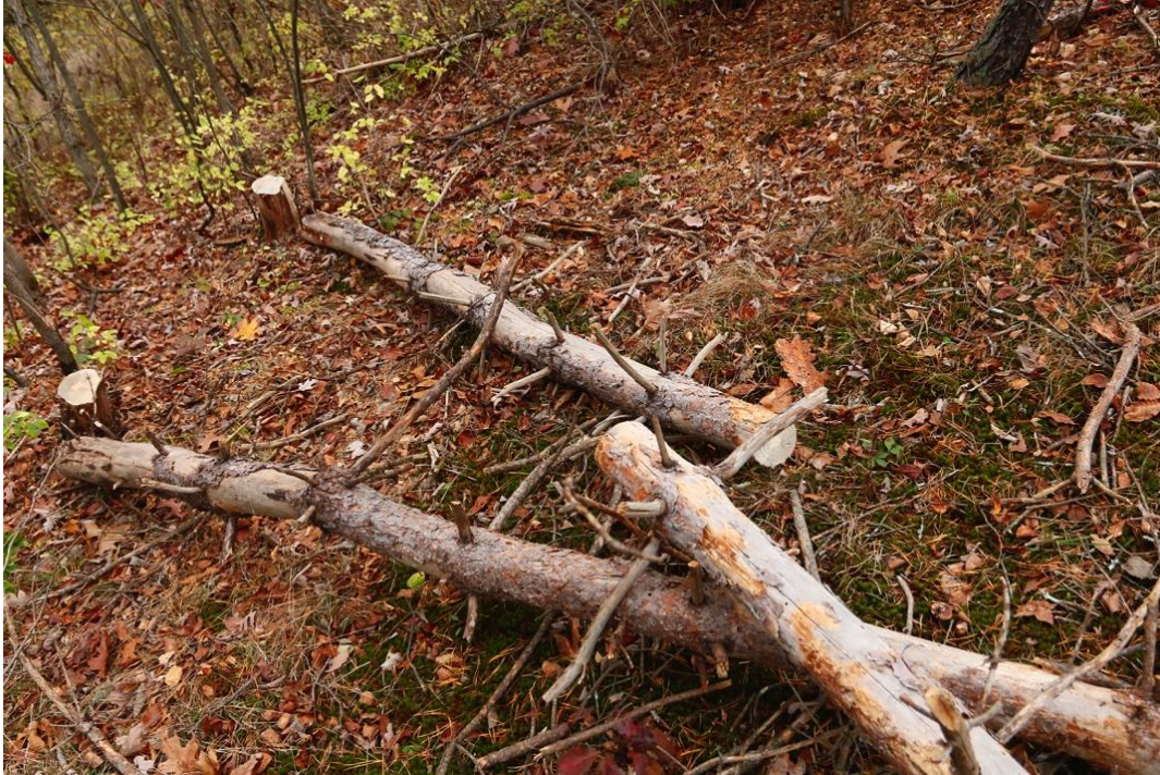
Figure 1: Luckily, the area was abundant with dead pine. I never had to cut down living trees.

Construction involved some guess-work and improvisation. For example, I nearly ran out of timber. One the rules I followed was complete reliance on dead trees or logs that were around the area because the hut is supposed to be an impermanent shelter. When I began building in early June, I constructed an octagon by digging holes and setting posts into the ground and started layering sticks in between them for the walls. I did not know at the time if this construction would suffice as I was taking an educated gamble at best. Eventually over the next month I slowly built the walls up enough to frame four windows. I constructed a two-layer wall, with a vertical wall on the outside and a horizontal wall on the inside (Figure 2). My design called for shoving leaves in the walls after the framework was done for insulation, which I hoped wouldn't be too far down the road. Everything depended on how much "free time" I had in a given day; this is truly the most important variable in any endeavor in the modern world. At this time, I often just slept by the fire and picked up work in the morning before I had to start any other work shifts. There were owls that lived on the hill that were drawn by the fire. I could see their still silhouettes on the branches as they called while the wood cracked in the fire.