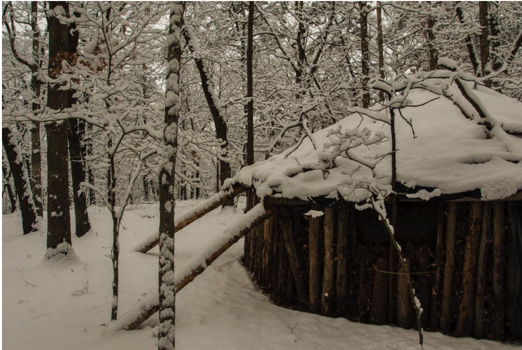
Figure 5: My hut in winter. I could usually get my shelter to a delightful forty degrees inside.

Contrary to what most people think, I enjoyed this project the most during the winter, because at that point I did not have to do more work on the shelter. I could finally find leisure time. I realized that the worst was over and I was still okay, and I really needed to ride it out until spring. I had the feeling of “it could not get any worse.” Well, it could, but the closer to the bottom the more relief I felt; I had made it and I was still very happy even in harsh conditions (Figure 5).