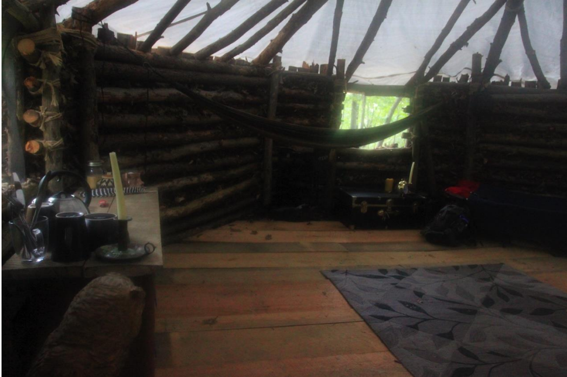
Figure 7: My hut was complete with a fold-out bed, a desk, a table, an oak floor, and a hammock.

To conclude, this project and life in the hut was my transition back into the modern world. The most challenging thing for me to do is to find a stable sense of happiness in the modern world. The reason I decided to work my way back into society is because few people can retreat into the woods for months at a time, let alone live there permanently. Perhaps I provided an example by living with the bare minimum, but I could never set the standard. I learned how to live moderately, but in modernity as well. I wanted to explore the possibility of finding the peace I knew that existed with life in the woods, yet remain in society. By building the hut close to civilization and bridging this long established gap, I really hope that I showed that — contrary to Thoreau and the ideal that he may have set forth —it is possible to find a stable sense of peace within modern society. Because, ultimately, there is no distinction between where we are now and in the woods.