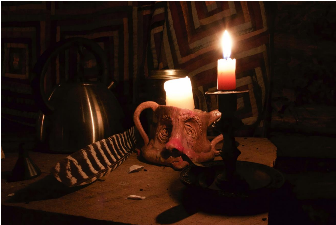
Figure 3: Candles were my main light source, especially in the winter when I had the windows sealed off and I was always in darkness.

I had midterms and finals to study for, but at the same time I saw the forest come alive with frenzied preparation, and I realized I had to be a part of it this year if I were to be comfortable and safe for the coldest months. Many times I had to skip classes to haul leaves out of a nearby valley to put in insulation. I filled over thirty industrial garbage bags with leaves to install in the roof and walls. Winter finally hit and life in the woods became a little calmer. Waking up in the woods in the morning is refreshing, but I did not keep my heater on at night. I would get out of my sleeping bag and it would be thirty degrees in the shelter. It was also always very dark inside, as it was sealed up to prevent heat from escaping. I kept a small propane stove in the hut for nasty days when I couldn't light a fire, and candles were my source of light. One time I fumbled around to make tea or something hot and I could not get the lighter to spark because it was too cold, so I flipped the lighter in front of a lit candle, and it blew a ball of flames into the wall. Luckily the leaves did not completely catch on fire. One or two did, but I could pull them out of the wall and stamp out the fire. That was the closest to disaster I have come. So far candles have not been a problem (Figure 3).