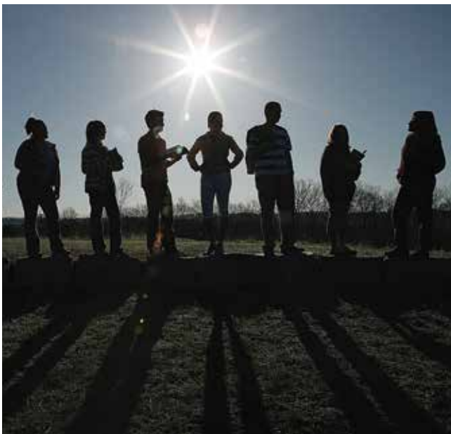
Baker Peace Chapel

Juniata is located in the county seat of Huntingdon, Pa., along the Juniata River in the heart of south central Pennsylvania, a half-hour drive from the metropolitan areas of State College to the north and Altoona to the west, and halfway between Interstate 80 and the Pennsylvania Turnpike. On the Baker-Henry Nature Preserve is the Baker Peace Chapel, designed by renowned architect Maya Lin. The Raystown Field Station provides one of the most distinctive opportunities in the nation to study environmental science. On campus, many impressive redbrick buildings surround a broad, open mall and quadrangle. Juniata students, faculty, and staff enjoy the beauty and functionality of a quintessential small college campus and the strong sense of community that characterizes the College.