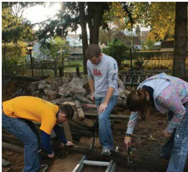
Juniata students working for Habitat for Humanity.

and 9 percent international. The College's current first-year retention rate is 84.6 percent, with a graduation rate of 75 percent in six years. The College was recognized with the HEED award by Insight into Diversity magazine in 2015, recognizing the College's "level of achievement and intensity of commitment in regard to broadening diversity and inclusion on campus."