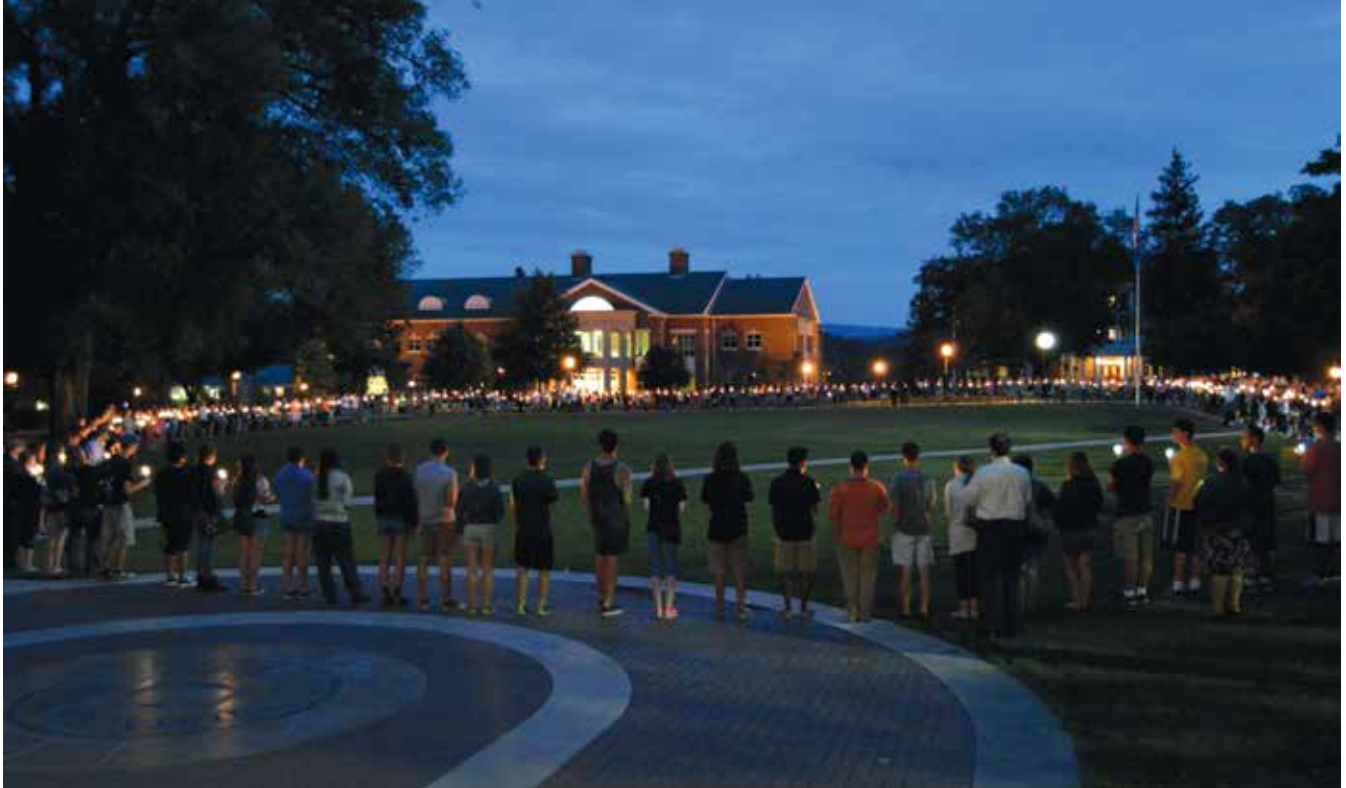
Freshman Welcoming Ceremony