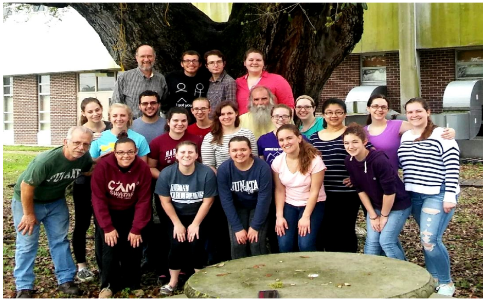
Juniata students and staff in New Orleans for an Alternative Spring Break service trip. They volunteered in community gardens in the Lower Ninth Ward.